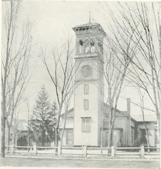
This building, without tower and front porches, was the first upon the present site on Walnut St.